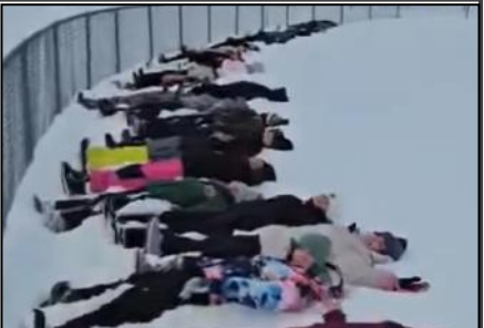
PICTURED HERE: E-TC students having fun during recess making a long line of snow angels on the playground.