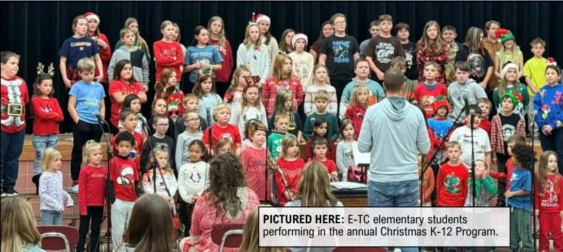
PICTURED HERE: E-TC elementary students performing in the annual Christmas K-12 Program.