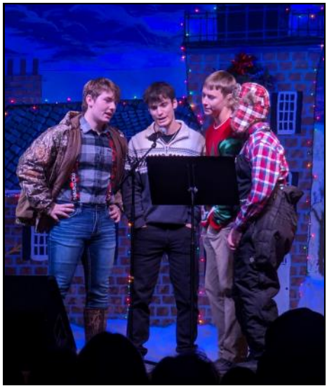
PICTURED ON RIGHT: Ontonagon students performing during their December 21 Christmas Concert.