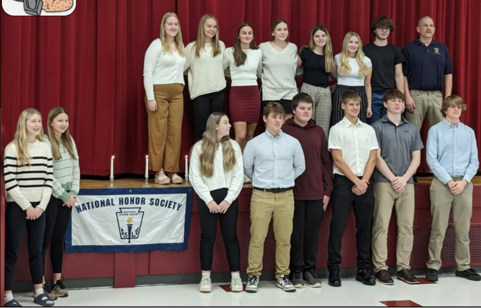
PICTURED ON LEFT: Ontonagon School's National Honor Society welcomed five new members during a ceremony held at the school on December 17.