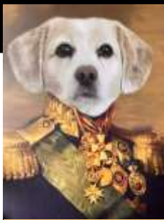
Charles Parker Maki-Schuster

Charlie wishes everyone a Merry Christmas and Happy Hannukah! He already has everything a dog could ever need, but he hopes you can make Christmas wishes come true for his furry friends who are in the OCAP shelter this holiday season.