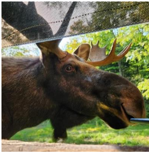
PICTURED ABOVE: As seen on Facebook: A Bear hunter staying at Krupps Resort in Twin Lakes recently had a unique, and exciting encounter with a curious moose. The hunter was able to take a short video of moose and even snapped a few quick pictures when the moose approached to sniff the barrel of the hunter's rifle!