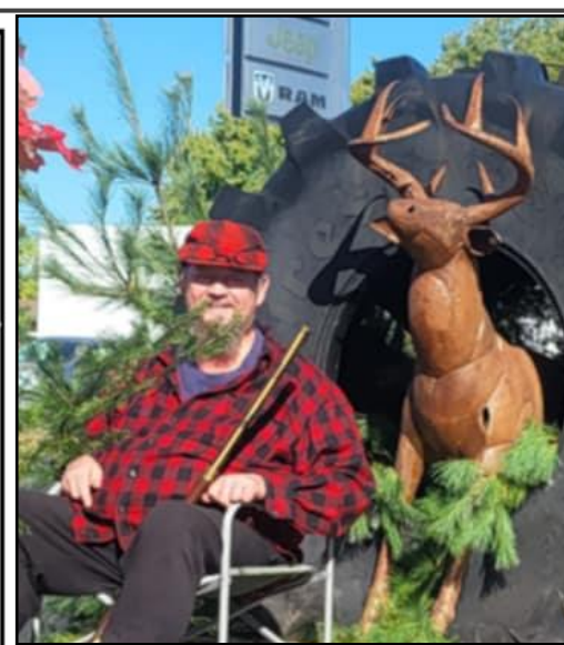
PICTURED ABOVE: In case you missed it... White Tail Tire Company's float won first place in this year's Log Jamboree parade in Ewen.

Your local tire experts. Our motto is service. Our ability is proven.