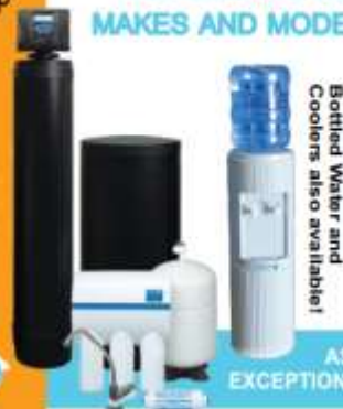
Bottled Water and Coolers also available!

Complimentary WATER ANALYSIS for home or business