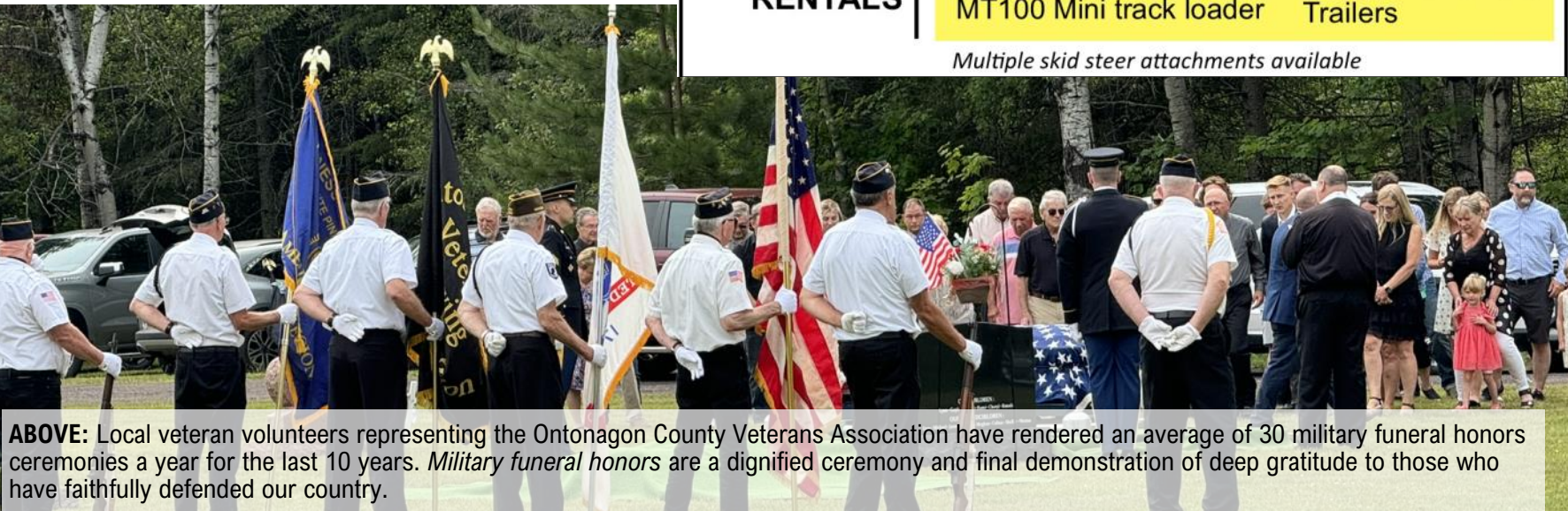
ABOVE: Local veteran volunteers representing the Ontonagon County Veterans Association have rendered an average of 30 military funeral honors ceremonies a year for the last 10 years. Military funeral honors are a dignified ceremony and final demonstration of deep gratitude to those who have faithfully defended our country.

Multiple skid steer attachments available