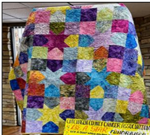
ABOVE: The "Star" quilt waiting for donations.