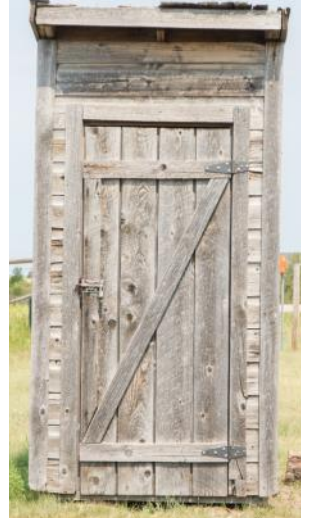
It's gonna be some silly sit!

Don't miss the OUTHOUSE RACE at the Bruce Crossing Independence Day Celebration on July 6!