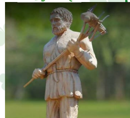
This statue honoring St. Urho was erected in Menahga, Minnesota in 1975. Legend has it that St. Urho chased grasshoppers away from the vineyards in Finland.

THE NEXT EDITION OF THE OTTAWA SHOPPER WILL BE PUBLISHED ON MARCH 25, 2024 (Submissions Due Mar 20)