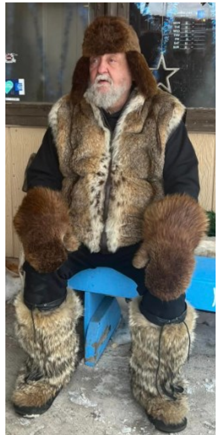
ABOVE: Keeping warm at the Annual Predator Round-up at Hoppy's Bar & Grill in Kenton.

WHITE PINE, MI: It looks like White Pine is busy planning their 2023 Independence Day celebration events to be held on July 28-29. Free food, bounce houses, games, 50/50, raffle baskets, live music, Warrior Weekend (all-school class reunion), plus fire-works are in the works.