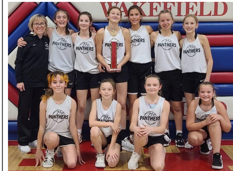
E-TC 7th grade players won the girls championship in October! Congratulations Lady Panthers!